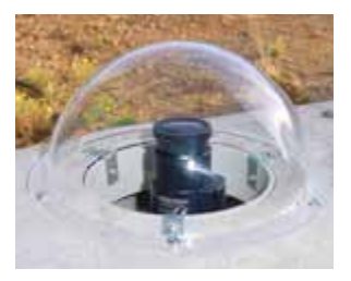
Sky light / Domes