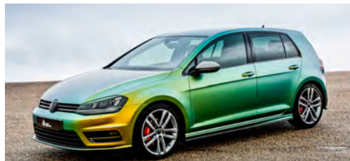
Fresh Spring | Gold/Silver