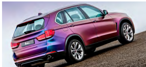
Rushing Riptide | Cyan/Purple