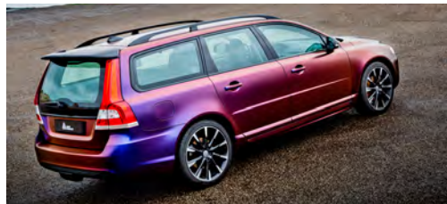
Roaring Thunder | Blue/Red