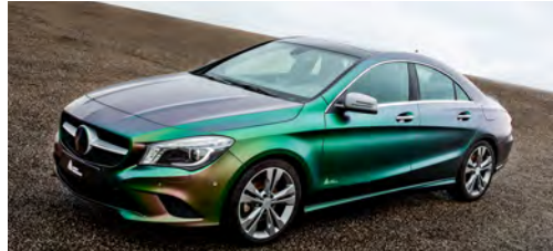
Urban Jungle | Silver/Green