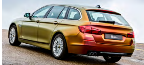
Rising Sun | Red/Gold